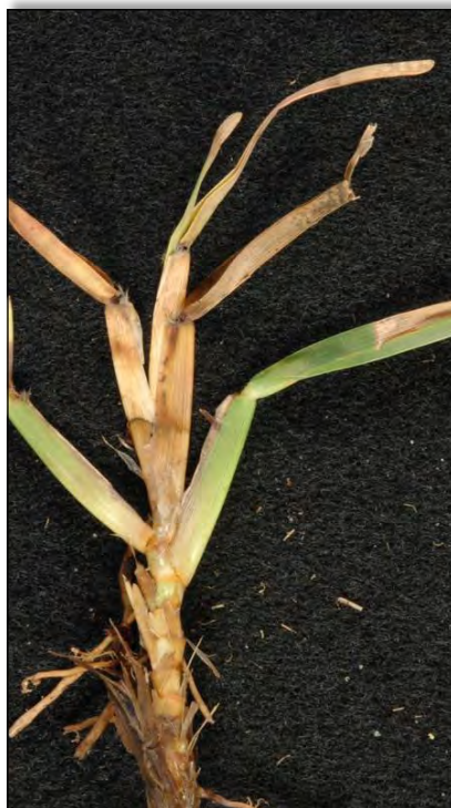
Large patch sheath lesions

below 70°F for several consecutive days. Subsequent applications should be made as specified on the fungicide label. We generally recommend at least two fungicide applications a month apart in the fall, the first being in mid- to late September and the second in mid- to late October. However, if conditions remain favorable for disease development into November and December, additional fungicide applications may be necessary. In areas where large patch is known to have