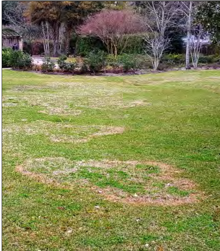
Large patch disease in a local lawn.

organic matter. When conditions are not favorable for growth, these fungi persist as mycelium or as sclerotia in the thatch and soil. When a host plant is present and environmental conditions are favorable, Rhizoctonia species begin to colonize the surface of the potential host plant.