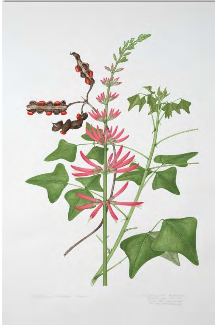
A watercolor painting of a coral bean plant with flowers and seeds from the book Native Flora of Louisiana - Watercolor drawings by Margaret Stones

browse food for whitetail deer but adapted to handle a periodic munching. Some bird species have also been observed feeding on the seeds. There is a borer moth ( Terastia metculosalis ) that feeds on the interior stem tissue, which can cause tip dieback. They don't kill the plant, and mamou is its host plant