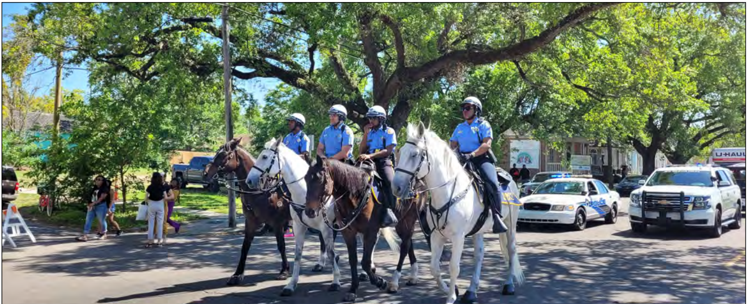
Mounted New Orleans Police ride in line after a street parade on Easter Sunday.