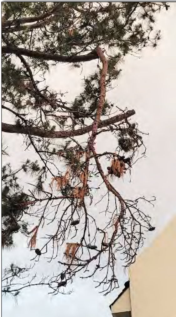
'Hangers' are dead limbs that have broken and are either being supported by other branches or hanging from a few remaining fibers.

L et's face the truth, trees can be incredibly dangerous. In fact, falling trees and limbs regularly kill and maim people. According to the Occupational Safety and Health Administration, there are typically over 100 fatalities each year in the US from falling trees and branches. They are so dangerous because trees are very heavy. Just one foot of an oak limb 10 inches in diameter weighs about 40 pounds. Add in the energy supplied by gravity when falling and we can see that even a small limb can cause serious damage on impact. Also consider that falling trees and limbs don't just harm people. They can also destroy homes, buildings, vehicles, and more. They also have a tendency to knock down power transmission lines leaving widespread areas without electricity. From my experience, I believe that many of these tragic incidents could have been prevented with proper horticultural practices.