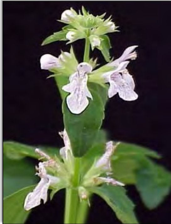
Florida betony flowers.