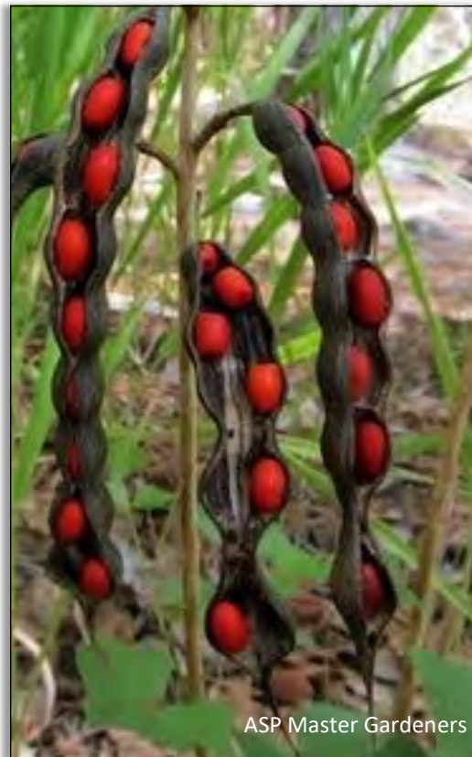
ASP Master Gardeners

Splitting seed pods reveal the coral red mamou seeds inside.