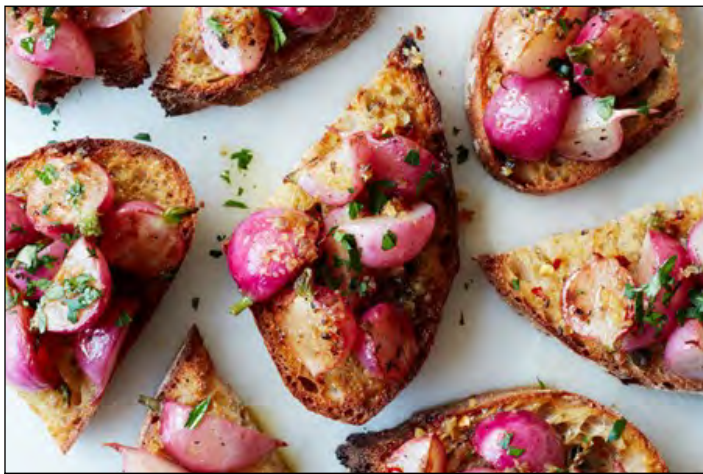
Roasted Radishes served on toast.