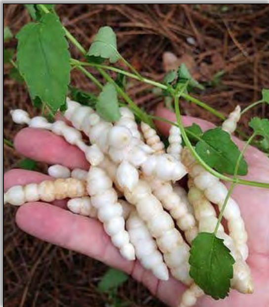
Florida betony tubers. Note the resemblance to rattlesnake rattles.