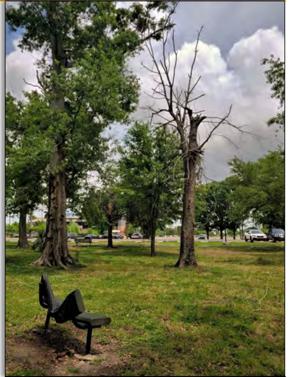
This dead tree remains standing in a local park where another falling tree recently destroyed a nearby bench.

Check out this great article from Dan Gill for more information on proper tree pruning. To view, click here or go to: http://apps.lsuagcenter.com/news_archive/2014/january/get-it-growing/Pruning-trees-requires-care-.htm .