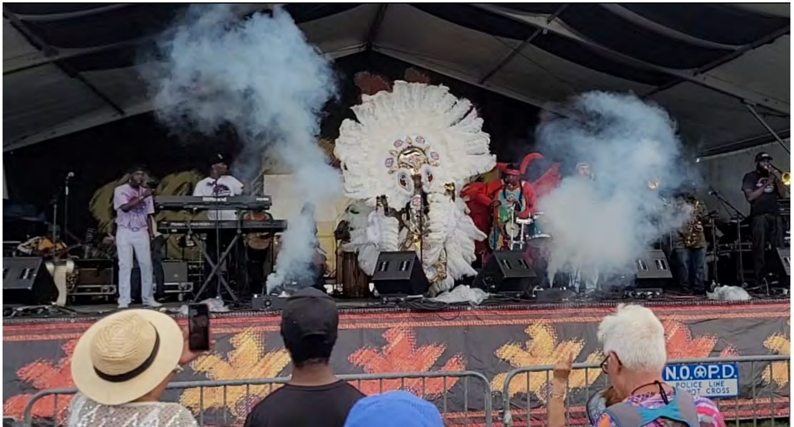
Mardi Gras Indians performing at the New Orleans Jazz and Heritage Festival.

If you would like your licensed retail nursery listed, please email gnogardening@agcenter.lsu.edu