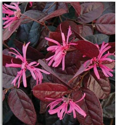
‘Fire Dance’ Loropetalum