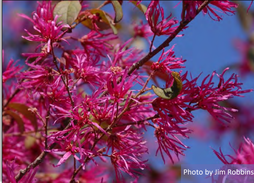
"Blush" Loropetalum flowers.

L oropetalum ( Loropetalum chinensis ), also known as Chinese fringe-flower, is an excellent choice for landscape color. People often plant it for its rich burgundy or purple foliage, a unique trait not typically seen in evergreen shrubs. But in January and February, this shrub produces abundant flowers that look like a colorful fringe along the branches. Chinese fringe flower ( Loropetalum chinense ) is an often-overlooked shrub for warmer climates. This member of the Hamamelidaceae family has softly crinkled evergreen foliage and profuse clusters of lightly scented, spidery