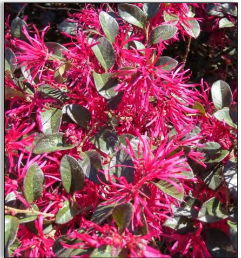
‘Crimson Fire’ Loropetalum