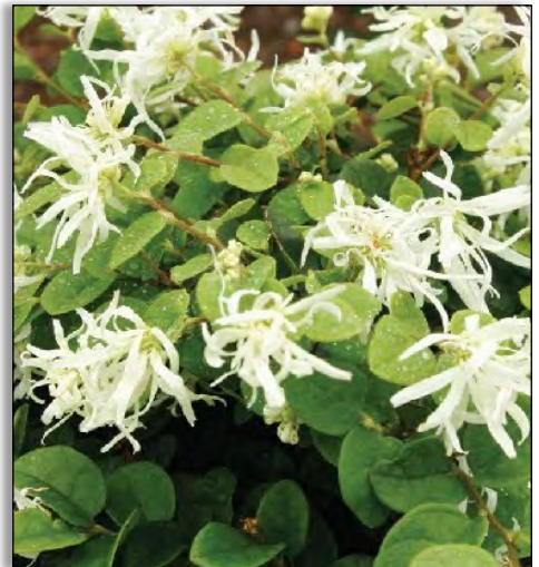
‘Emerald Snow’ Loropetalum