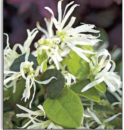
‘Carolina Moonlight’ Loropetalum