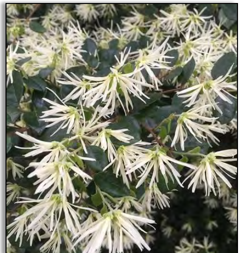
‘Snow Dance’ Loropetalum