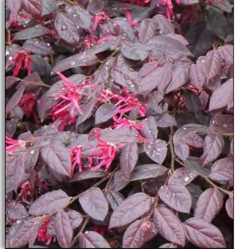
‘Carolina Midnight’ Loropetalum