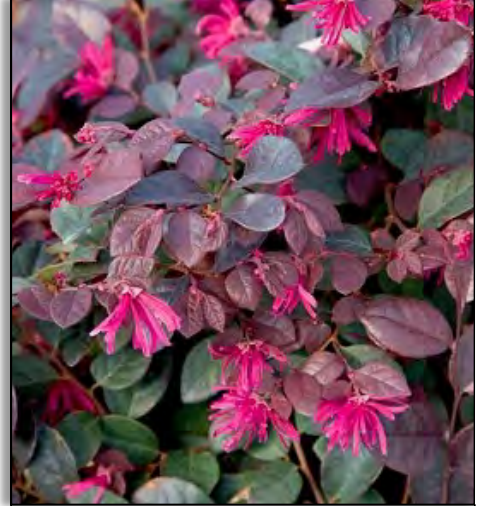
'Jazz Hands Bold' Loropetalum