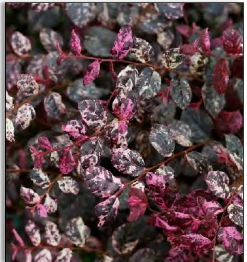
'Jazz Hands Variegated' Loropetalum