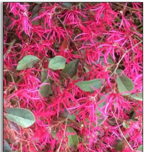
'Pipa's Red' Loropetalum