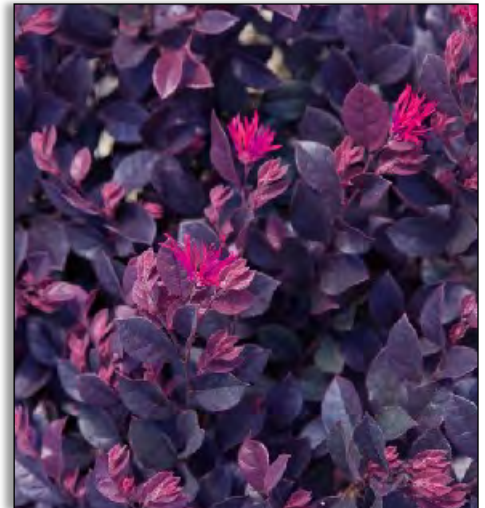
'Purple Daydream' Loropetalum