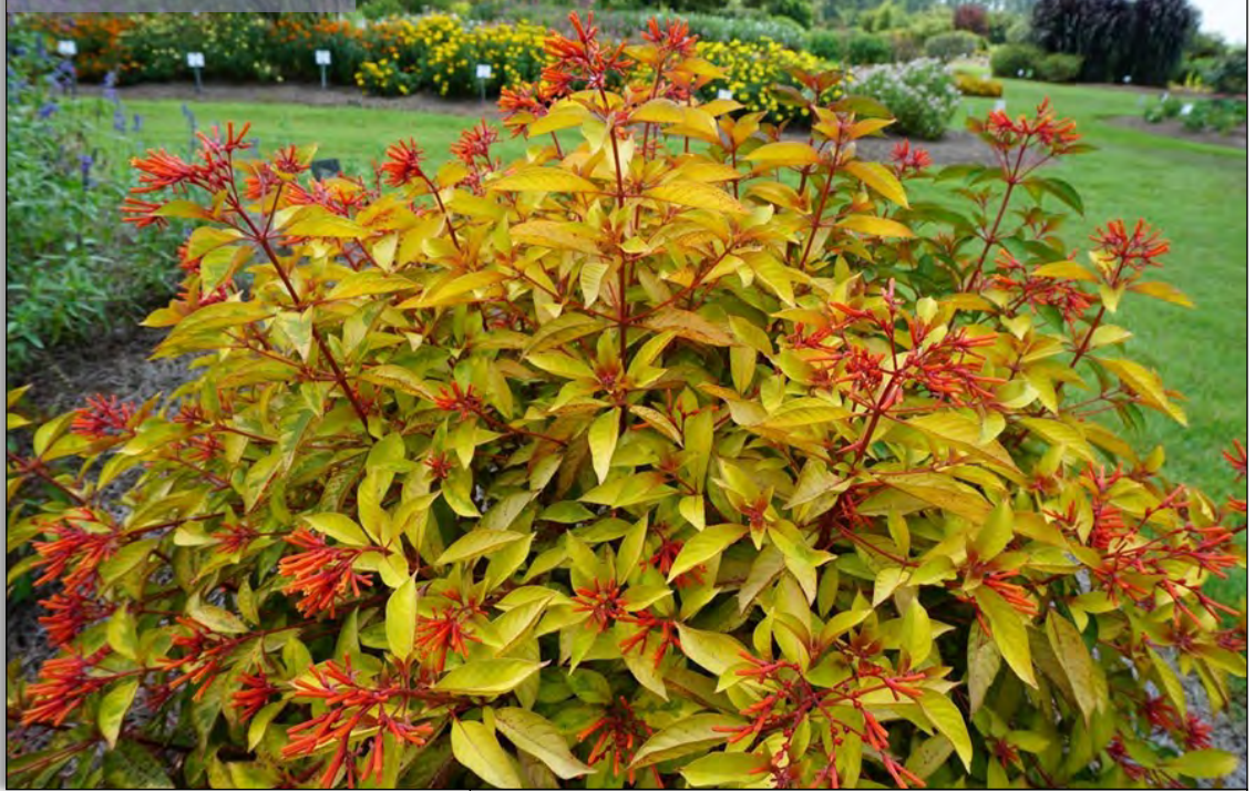
Common Firebush, Hemelia patens