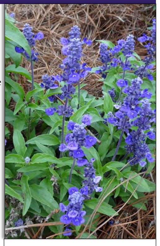
Violet Evolution salvia in bloom.

The plants have a nice compact habit. White Evolution Salvia can grow to 10-12 inches while Purple Evolution Salvia can grow up to 14 inches tall. Plants are relatively disease and pest free. Pollinators such as honeybees, butterflies, and hummingbirds will be more likely to visit your garden with these! ~Toni Thomas