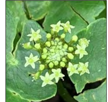
Figure 3: Umbel of small, white dollarweed flowers.