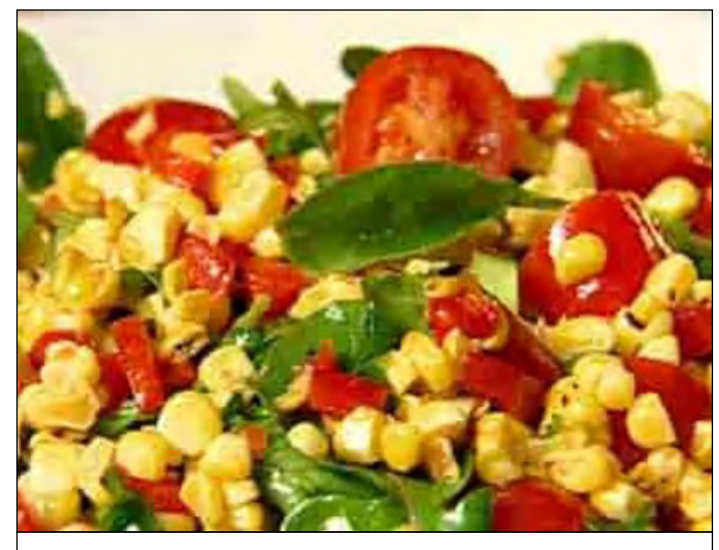
A bowl of fresh corn salad.