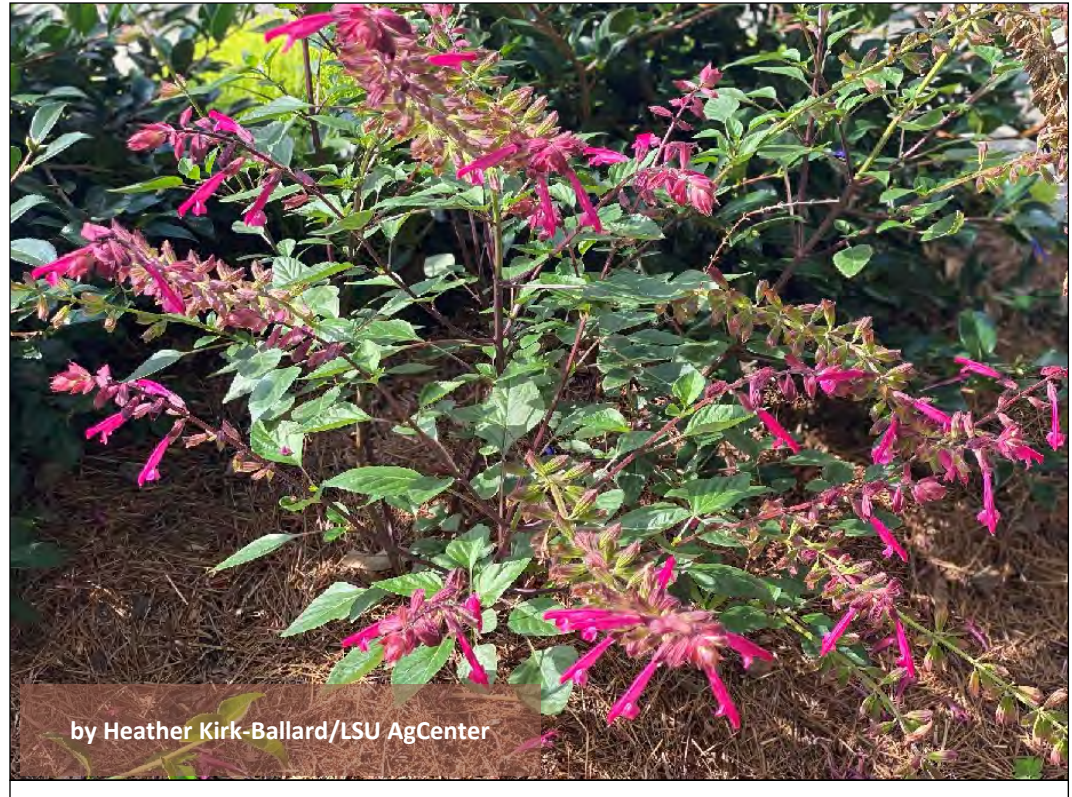
Salvias come in a wide range of colors, such as this hot pink.

Varieties that grow in USDA hardiness zones 8 to 10 are an excellent choice for landscapes in Louisiana for their reliable color and flower production. Their nectar makes them fan favorites for pollinators such as butterflies, hummingbirds and bees.