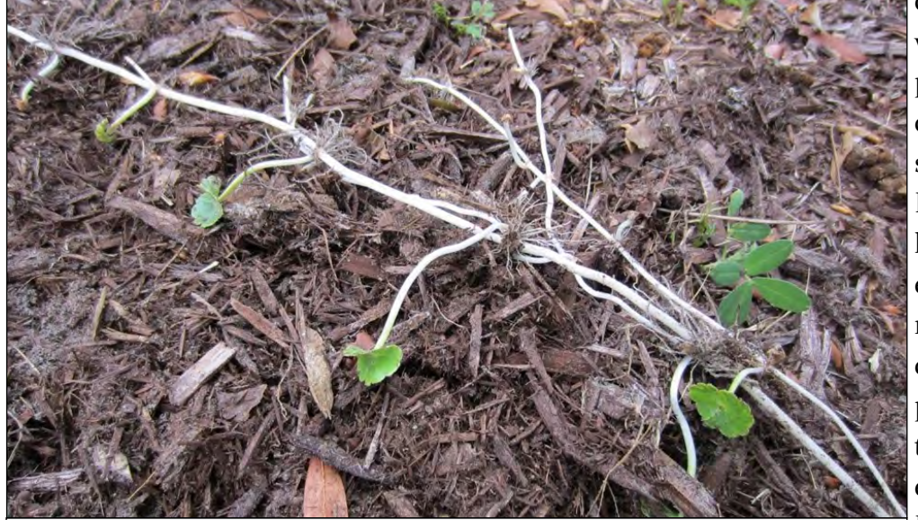
Figure 2: Underground stem (rhizome) of dollarweed. Note the roots formed at each node.

when we tell them they have a drainage problem, they swear that their lawn drains great and drainage is not an issue. The presence of dollarweed begs to differ.