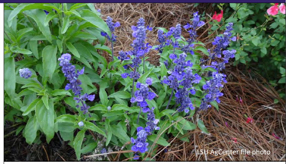
Violet Evolution salvia in bloom.

When speaking of salvias, white and purple blooms are most common, but new varieties come in shades of orange, red and blue. If you are trying to achieve a patriotic red, white and blue garden, salvias can make it happen for you.