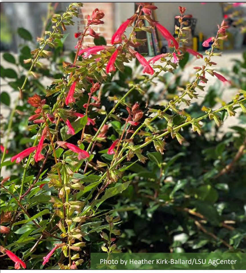
Salvias have vigorous growth and excellent flower production.

Some great varieties include the Evolution series, which is a Louisiana Super Plant program selection. This series comes in both violet and white bloom colors. The Wish series is another great choice. These include Wendy's Wish, Ember's Wish and Love and Wishes. The Skyscraper series is a new series that includes Skyscraper