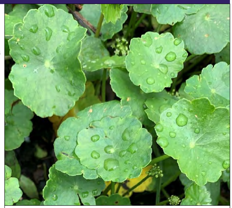
Figure 1: Dollarweed ( Hydrocotyle umbellate ) round, wavy-edged leaves with center petiole attachment.

Probably everyone in our area can easily identify