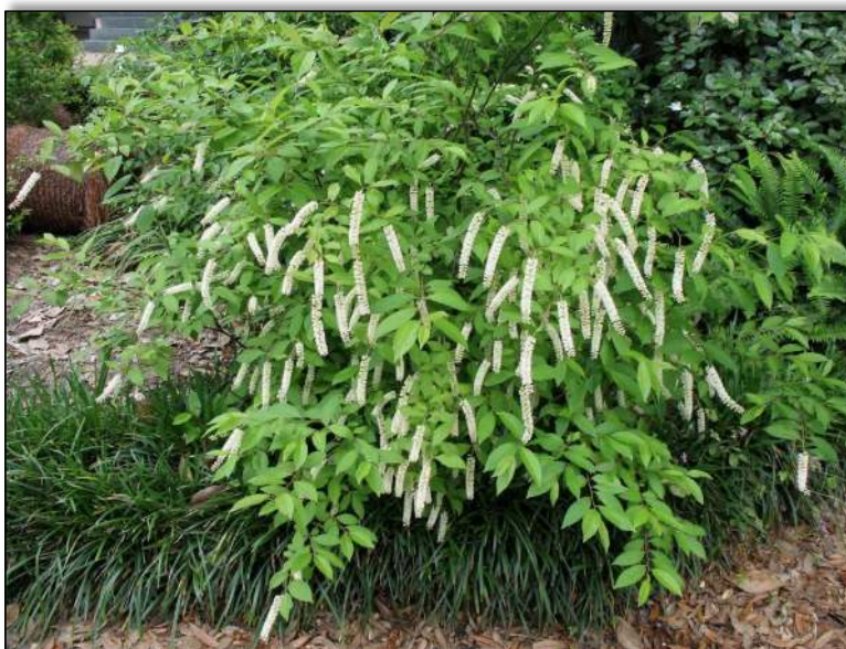
A flowering ‘Henry’s Garnet’ Virginia Willow Itea virginica

In addition to outstanding fall color, ‘Henry’s Garnet’ Virginia Willow has a wonderful display of delicate,