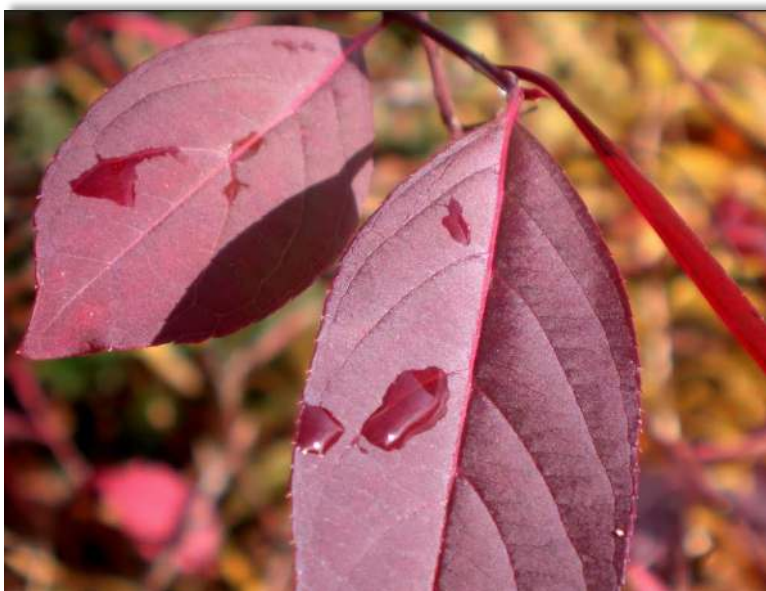
Fall red leaves of a ‘Henry’s Garnet’ Virginia Willow Itea virginica

Sweetspire will grow to be three to eight feet tall, so plan to give it some room. It responds well to pruning during the dormant months to