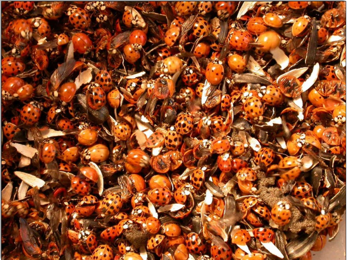
Figure 1. Thousands of harmonia axyridis congregating for the winter.

dwelling and other manmade objects which it uses as overwintering sites. Adult Asian lady beetles enter dwellings they are attracted to through cracks, crevices and other small openings around windows, doors and roofs. This flight to cover is triggered by