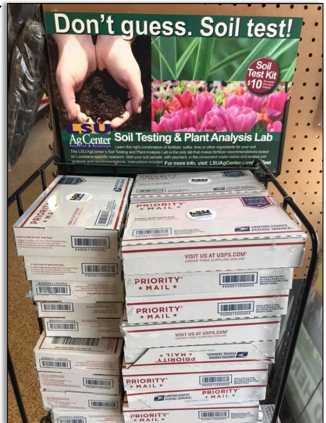
Soil test kits can be picked up at our parish offices and at local garden centers.

Your Local Extension Office is Here to Help