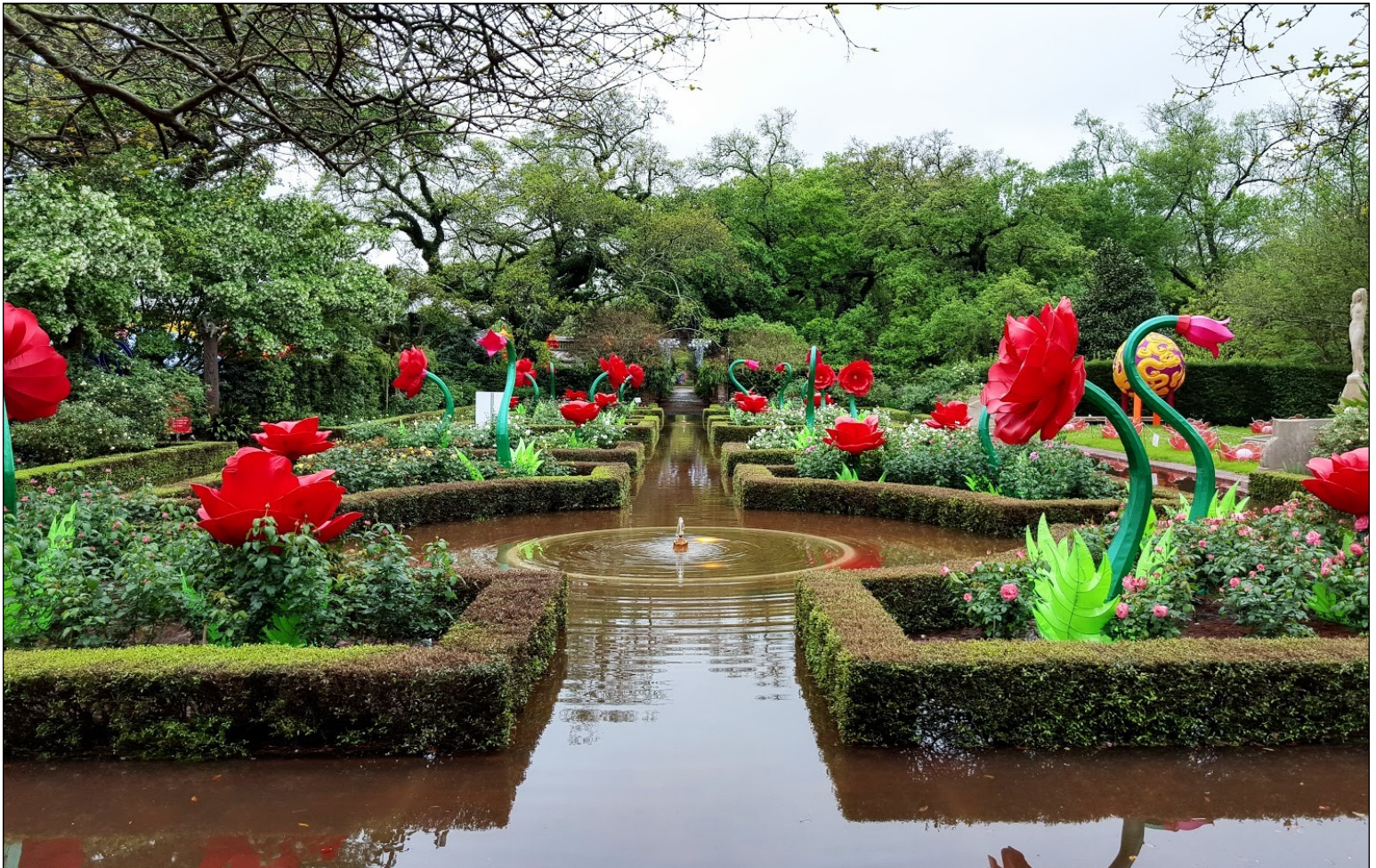
A photo from the New Orleans Botanical Garden from April 1, 2016, the day before the New Orleans Spring Garden Show. Fortunately the park has good drainage and the water was gone by the next morning.