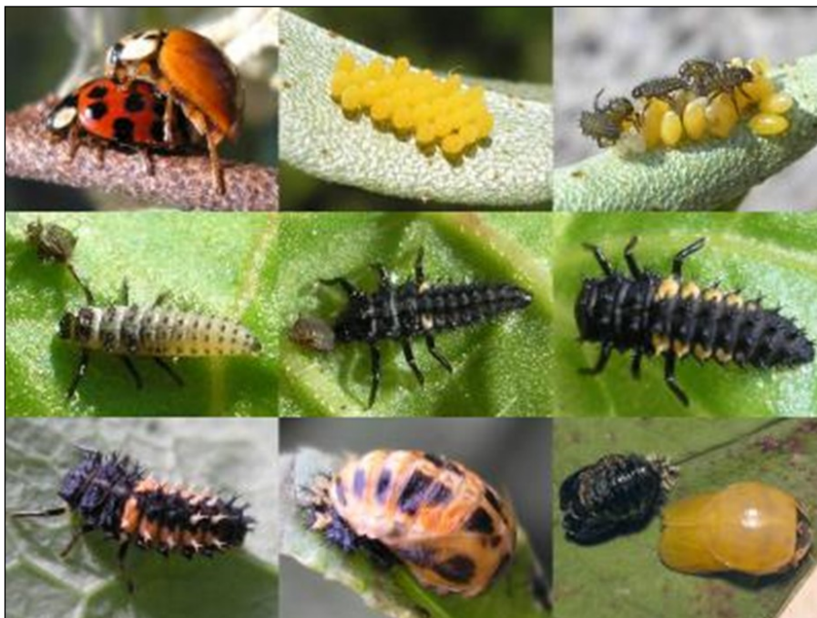
Figure 3: The four stages of development. Mating adults, eggs, emerging larvae, 4 larval instars, pupa, emerged adult with empty pupal case.

bad," (the rest of that quote is, "but too much good whiskey is barely enough").