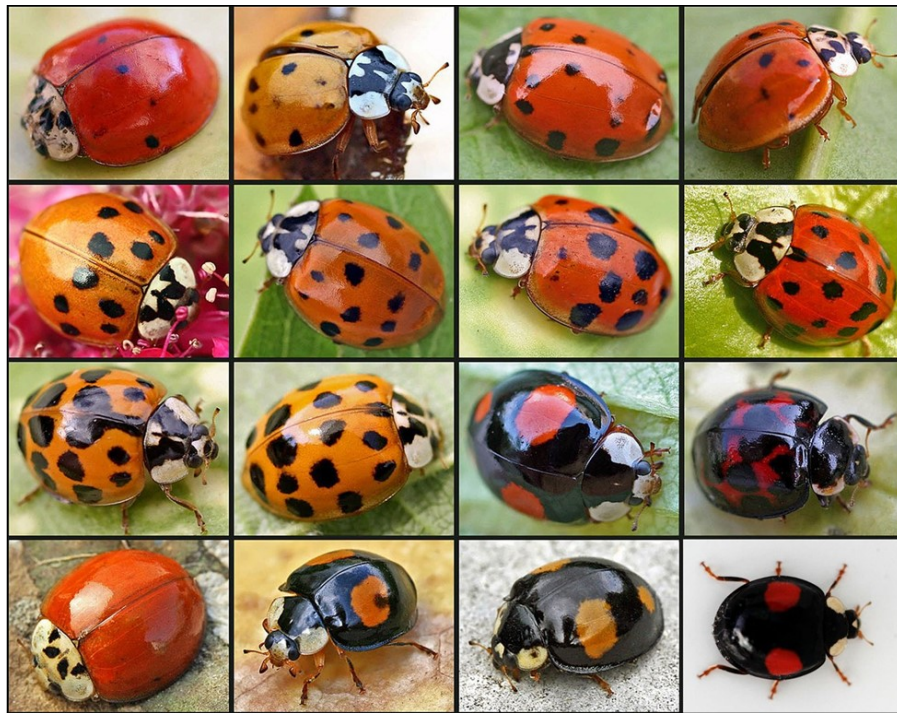
Figure 2. Some of the diverse color patterns of Harmonia axyridis .

Keeping this beneficial insect from becoming a winter nuisance takes some diligence. They are mostly attracted to bright colors on southern facing surfaces. They will enter any opening they can locate to find protection during lean cold weather. Therefore, the most effective preventative is to seal any outside cracks, crevices or other openings around doors, windows and roofs. If they are a recurring nuisance, you may want to consider repainting with a darker color. Like Mark Twain said, "Too much of a good thing is