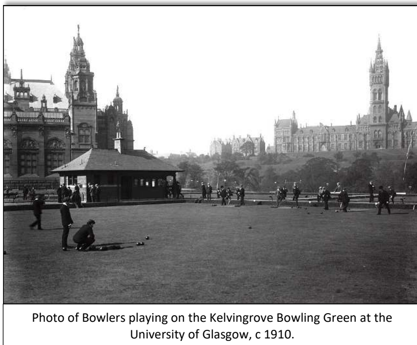
Photo of Bowlers playing on the Kelvingrove Bowling Green at the University of Glasgow, c 1910.